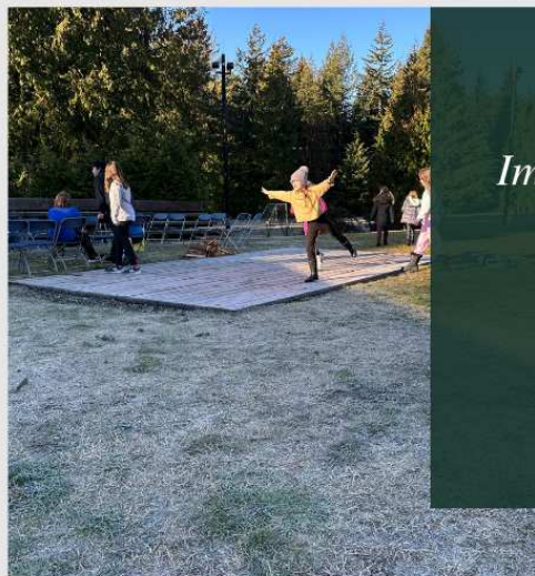
Improvised skating rink