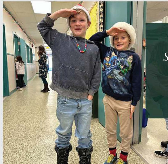
Santa Hat Brigade